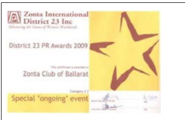
Above is the award received by our club for the IWD event organised each year in Ballarat