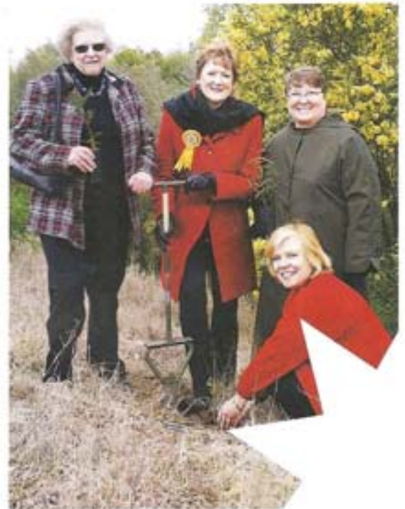
City of Ballarat Community Magazine October 2009