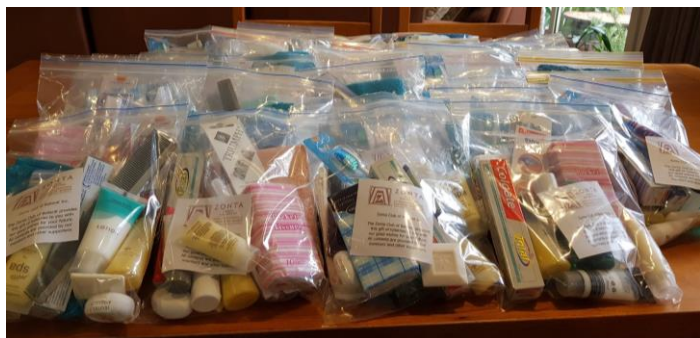
The Toiletry Bags donated to Berry Street earlier this year

Earlier this year, our Club donated a collection of Toiletry Bags to Berry Street, to assist women who leave their homes because of domestic violence.