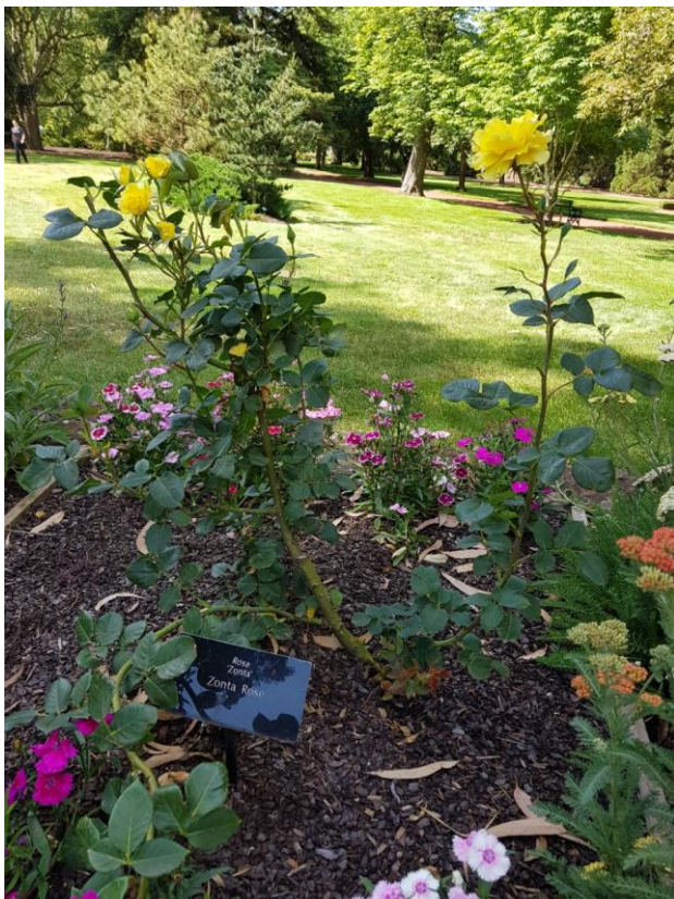
One of the four Zonta roses planted in the Sensory Garden, some of the roses are hard to find as they are planted among the herbs, both growing beautifully