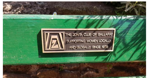
This plaque commends our service locally