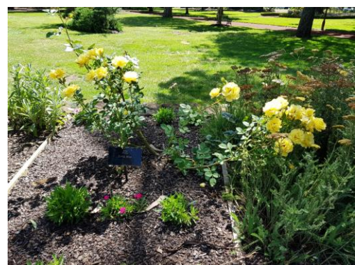
Another Zonta rose

A huge thank you to the staff at City of Ballarat Parks and Nursery for organizing and installing the plaques, they are spectacular and you did an awesome job!