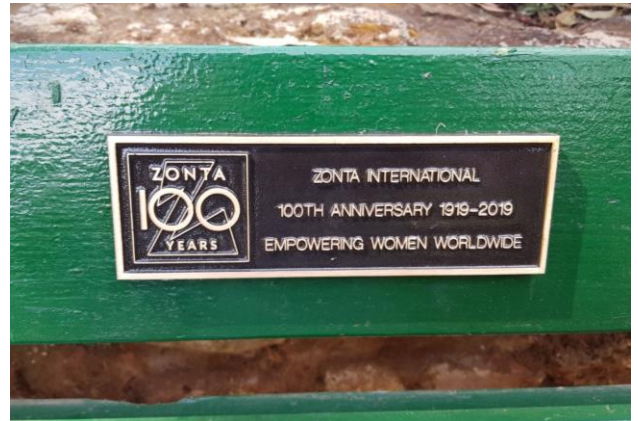
This plaque celebrates Zonta's Centenary

Last year, our Club decided to celebrate Zonta's Centenary by placing two plaques on the seats on either side of the water fountain in the Sensory Garden, which is part of Ballarat's Botanical Gardens.