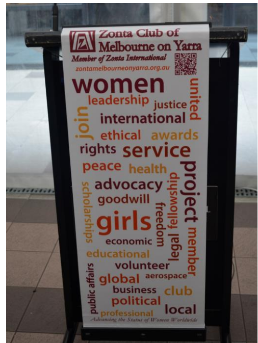
Melbourne on Yarra's Lectern Banner