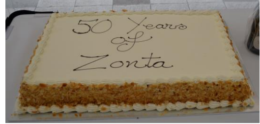
The Anniversary Cake, which was delicious!