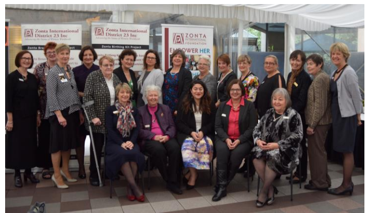
Members of the Zonta Club of Melbourne on Yarra