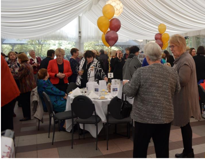
Members catching up at the beginning of celebrations

The 50 th Anniversary Luncheon of the Zonta Club of Melbourne on Yarra was held on Saturday 28 th May 2016.