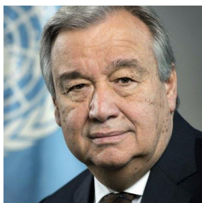
Antonio Guterres, Secretary-General of the United Nations

We know that achieving a more gender equal world, and advancing the Sustainable Development Goals, requires a shift in power at all levels – including across some of the world's most influential institutions like the United Nations.